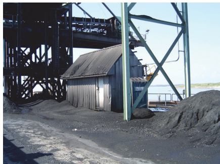
MIC Series Cameras withstand wet conditions and debris to capture the image.